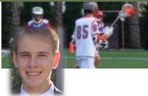
85 JACKSON DAY

85 JACKSON DAY MIDFIELD 2019 6'0 160 EAST LAKE